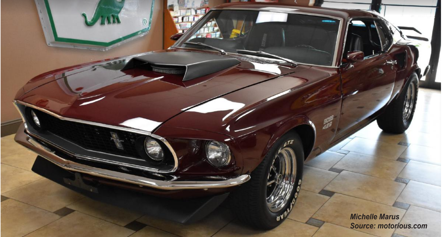
Michelle Marus Source: motorious.com

If owning a super rare, one-of-a-kind Mustang is on your bucket list, look no further. Today is the day you can take charge of your dreams and make it a reality. Ideal Classic Cars of Venice, Florida is more than happy to offer up this stunning 1969 Ford Mustang Boss 429 for sale. It definitely won't be available for long, as this model is a hot commodity and valuable one at that. It is a collectible that will see its worth continue to rise throughout the years.