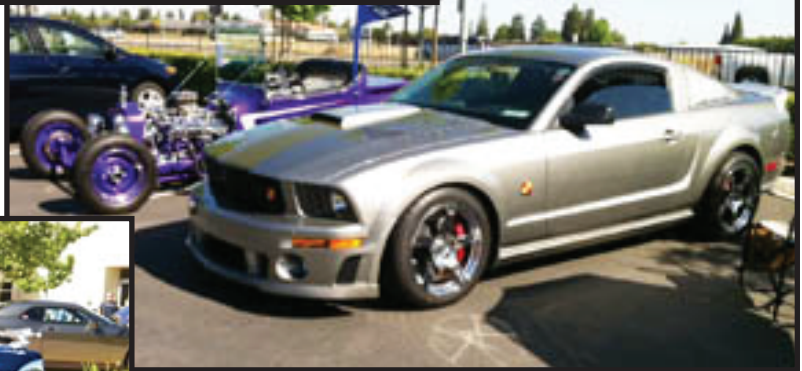
Old and New hot rods