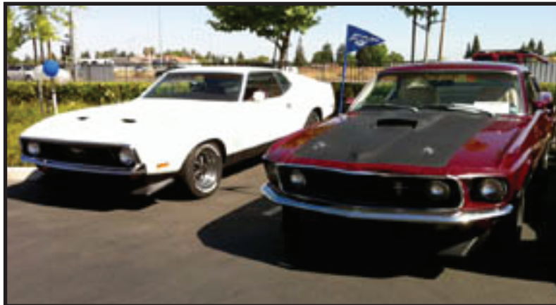
The Mach's are represented