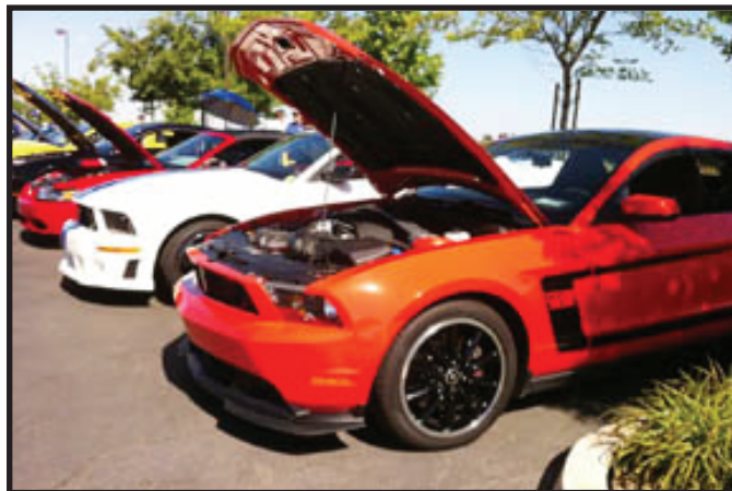
Lined up to show