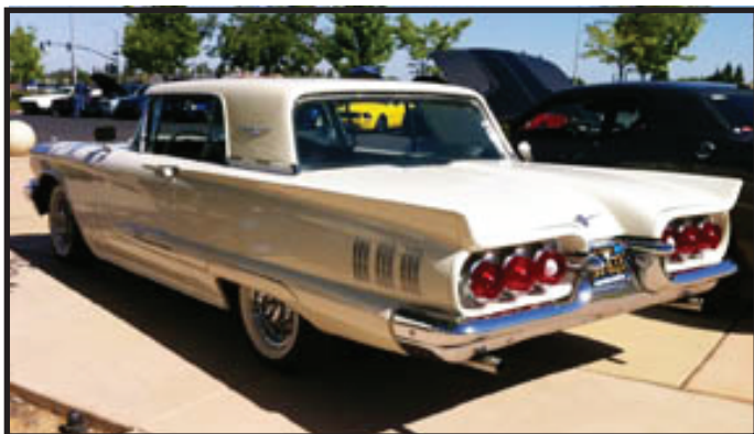
Nice old Bird