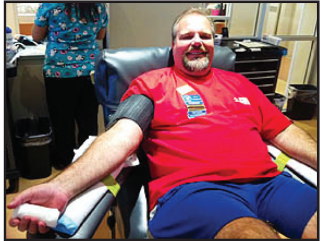
Our fearless leader donating blood