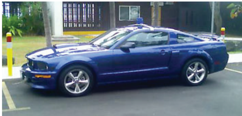
Actual police car in Kona Hawaii