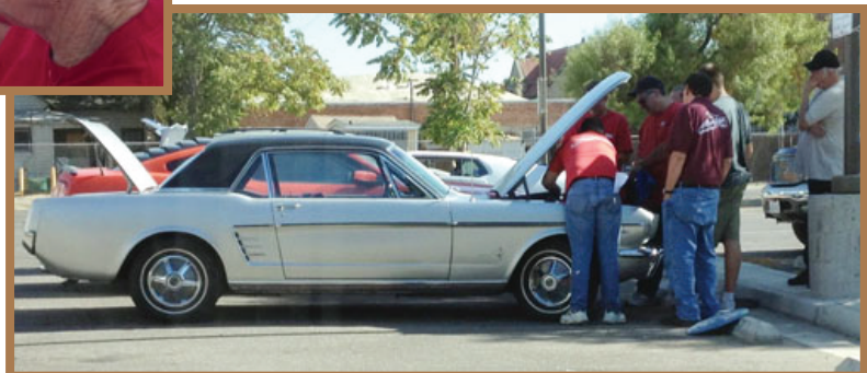
No really, it runs on ice cream!