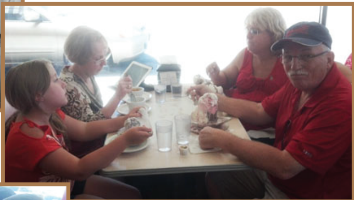
No interruptions please