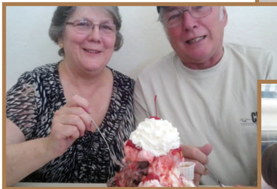
Ice Cream and smiles