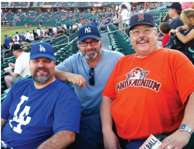
Dodgers, Yankees and Red Socks OH MY!