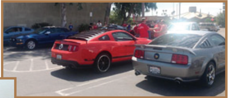
Ready to roll out

The Central Valley Mustang Club and Superior Dairy, what's not to love? Club had a great run, great ice cream and a great time with friends.