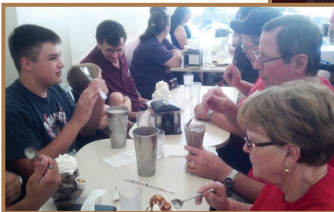
Only thing heard at this table was spoons scrapping