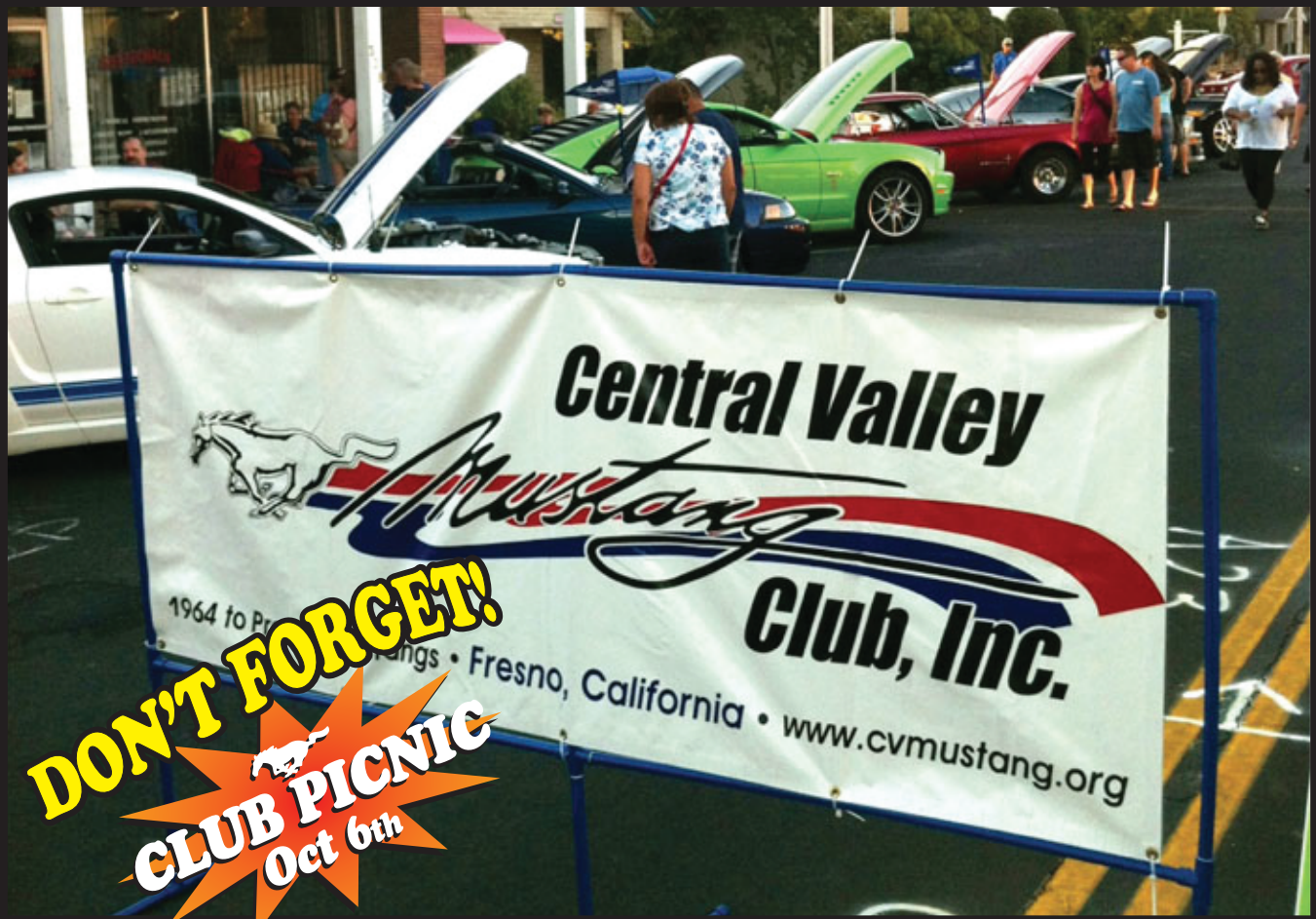
Clovis Farmer's Market