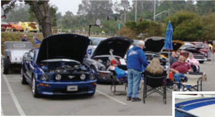
Representing as usual