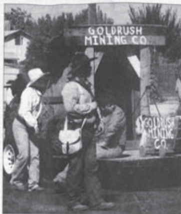
Parade Sweepstakes Trophy entry Gold Rush Gunslingers

Place Valley Prep Cheer; Second Place CVC Allstars Cheer Cheer Team, Peewee: