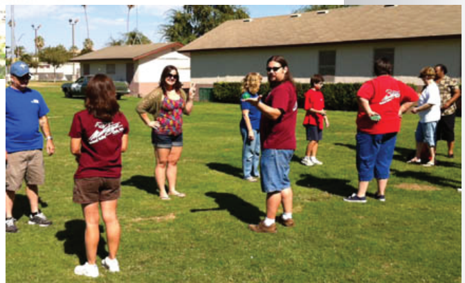
Water balloon toss is about to get wild