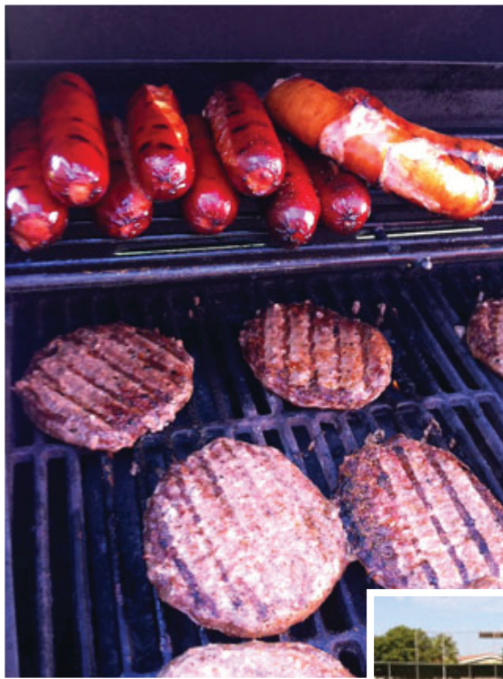
Plenty of food!