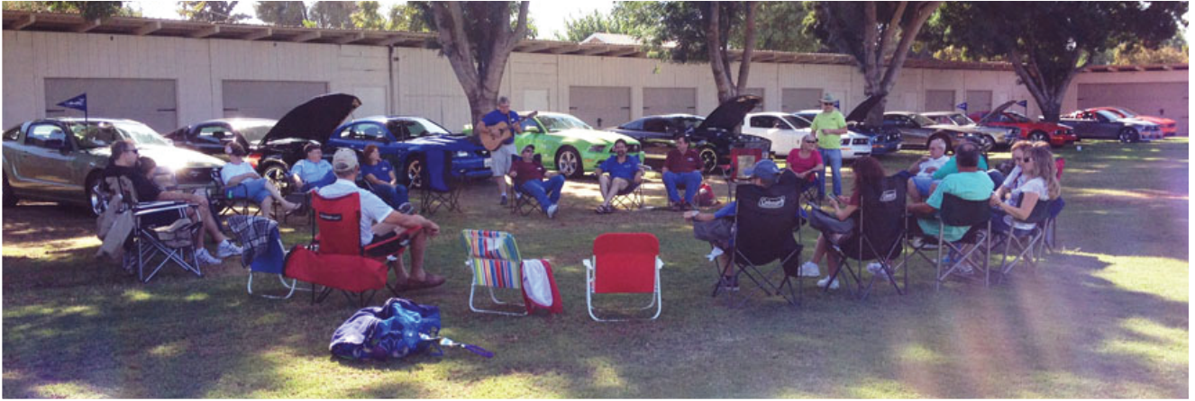
The gang just chillin' on a great day