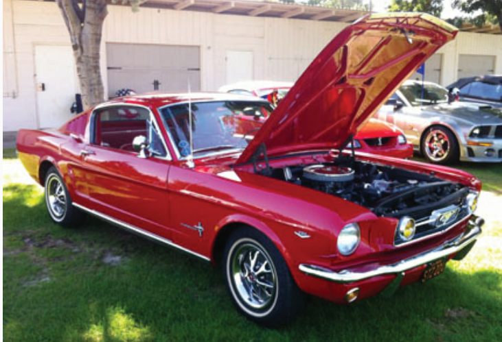
We even had the classics out