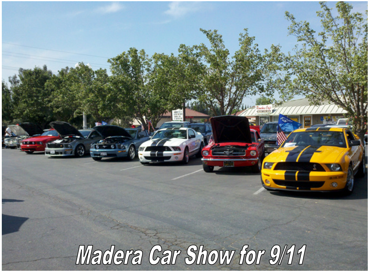
Madera Car Show for 9/11